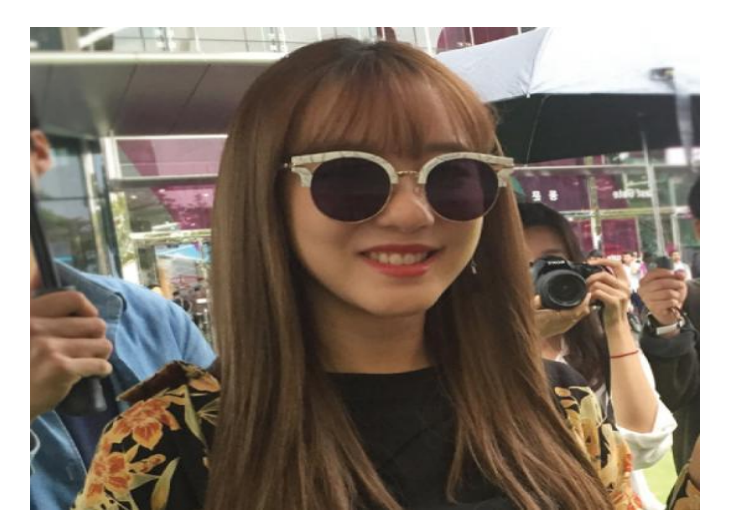
<Girl group 'rainbow' Uri Go>