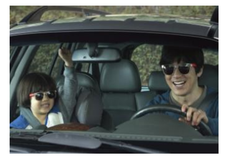
<Movie 'Lucid dream' actor Su Go>