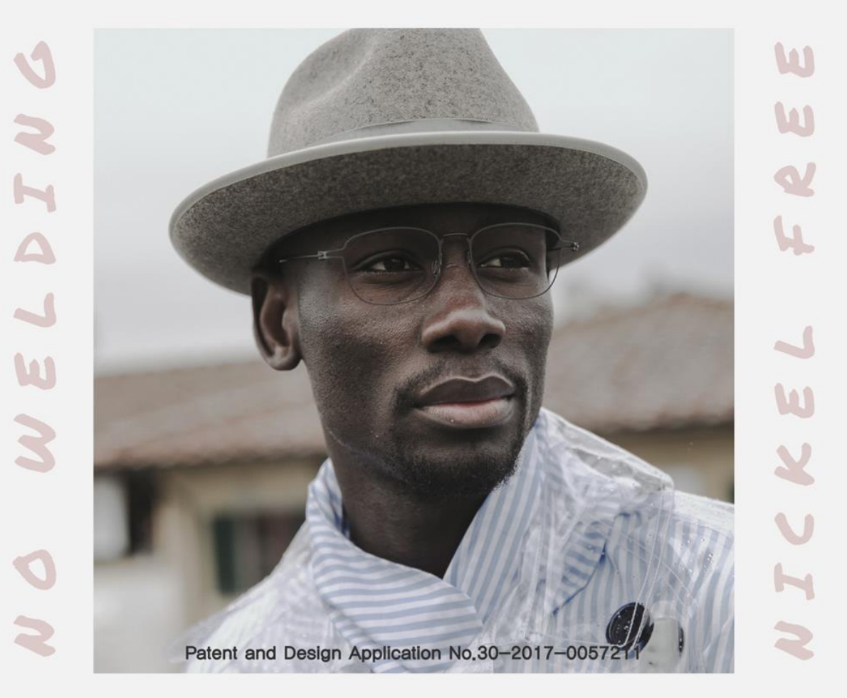
GANEKO UNIT's new collection combines luxury and uniqueness The welding part does not break due to outworn and has a long life Nickel free,light and comfortable, without skin allergies