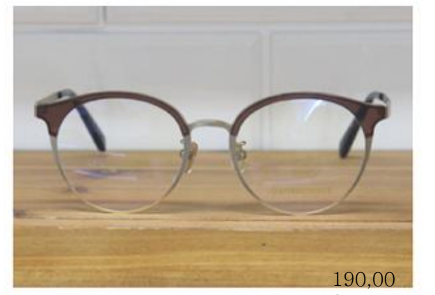
MATERIAL 0 acetate + β - titanium